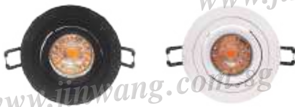
613-1L-RD White / Black

LENGTH: \Phi 92\text{mm} CUT HOLE: \Phi 75\text{mm} MATERIAL: Aluminum FITTING: GU10 / LED MODULE