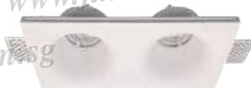
718-2L White / Black

LENGTH: L120 \times W240 \times H65\text{mm} CUT HOLE: 135 \times 245\text{mm} MATERIAL: Gypsum FITTING: GU10 / LED MODULE