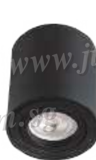
712-H95-RD White / Black

LENGTH: \Phi 80 \times H 45 \text{ mm} MATERIAL: Aluminum FITTING: GU10