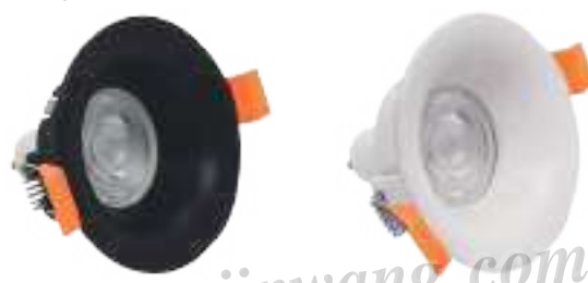
609-RD White / Black

LENGTH: \Phi 82 \times H 28 \text{mm} CUT HOLE: \Phi 75 \text{mm} MATERIAL: Aluminum FITTING: GU10 / LED MODULE