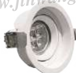
616-RD White / Black

LENGTH: \Phi 90 \times H 45 \text{mm} CUT HOLE: \Phi 75 \text{mm} MATERIAL: Aluminum FITTING: GU10 / LED MODULE