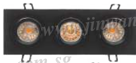
613-3L White / Black

LENGTH: L260 \times W92\text{mm} CUT HOLE: L240 \times W75\text{mm} MATERIAL: Aluminum FITTING: GU10 / LED MODULE