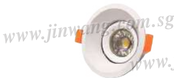
911-RD WH+BK / WH+RO

LENGTH: \Phi 90 \times H 45 \text{mm} CUT HOLE: \Phi 75 \text{mm} MATERIAL: Aluminum FITTING: GU10 / LED MODULE