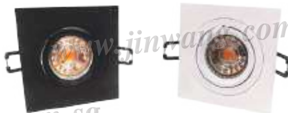
613-1L-SQ White / Black

LENGTH: L92 \times W92\text{mm} CUT HOLE: L75 \times W75\text{mm} MATERIAL: Aluminum FITTING: GU10 / LED MODULE