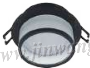
773 White / Black

LENGTH: \Phi 92 \times H 51.5 \text{ mm} CUT HOLE: \Phi 75 \text{ mm} MATERIAL: Aluminum FITTING: GU10 / LED MODULE