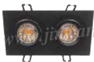
613-2L White / Black

LENGTH: L175 \times W92\text{mm} CUT HOLE: L155 \times W75\text{mm} MATERIAL: Aluminum FITTING: GU10 / LED MODULE