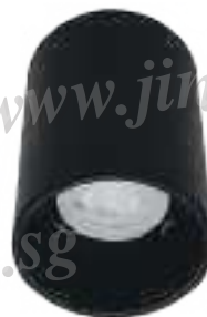
730B White / Black

LENGTH: \Phi 70 \times H 100 \text{ mm} MATERIAL: Aluminum FITTING: GU10