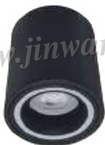
731 White / Black

LENGTH: \Phi 80 \times H 90 \text{ mm} MATERIAL: Aluminum FITTING: GU10