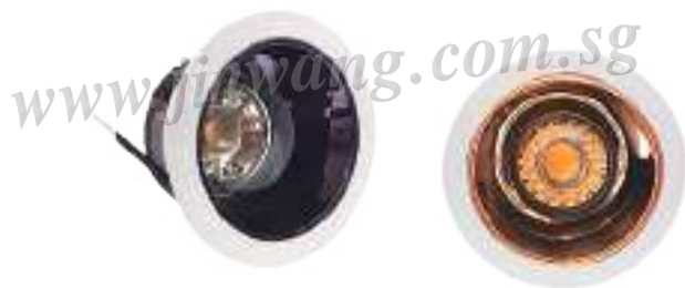
608-RD WH+BK / WH+RO

LENGTH: \Phi 90 \times H 50 \text{mm} CUT HOLE: \Phi 75 \text{mm} MATERIAL: Aluminum FITTING: GU10 / LED MODULE