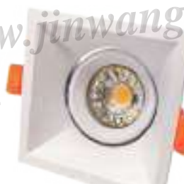
911-SQ White / Black

LENGTH: L 90 \times W 90 \times H 45 \text{mm} CUT HOLE: L 75 \times W 75 \text{mm} MATERIAL: Aluminum FITTING: GU10 / LED MODULE